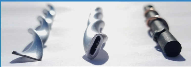
Shell & Tube (Table 2)